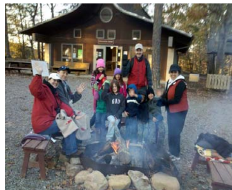
Folks warming by campfire in front of Interpretive Center

on the Interpretive Committee can involve the students in hiking, games, demonstrations, story telling and more. Stephanie has made such improvements inside our building, with displays and activities for children and adults. The story area is being utilized by park visitors, and we plan to have more planned story telling and reading times. We have also discussed planning more activities for seniors.