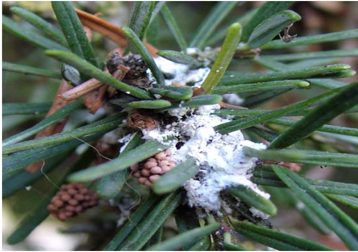
The Hemlock Woolly Adelgid (HWA)